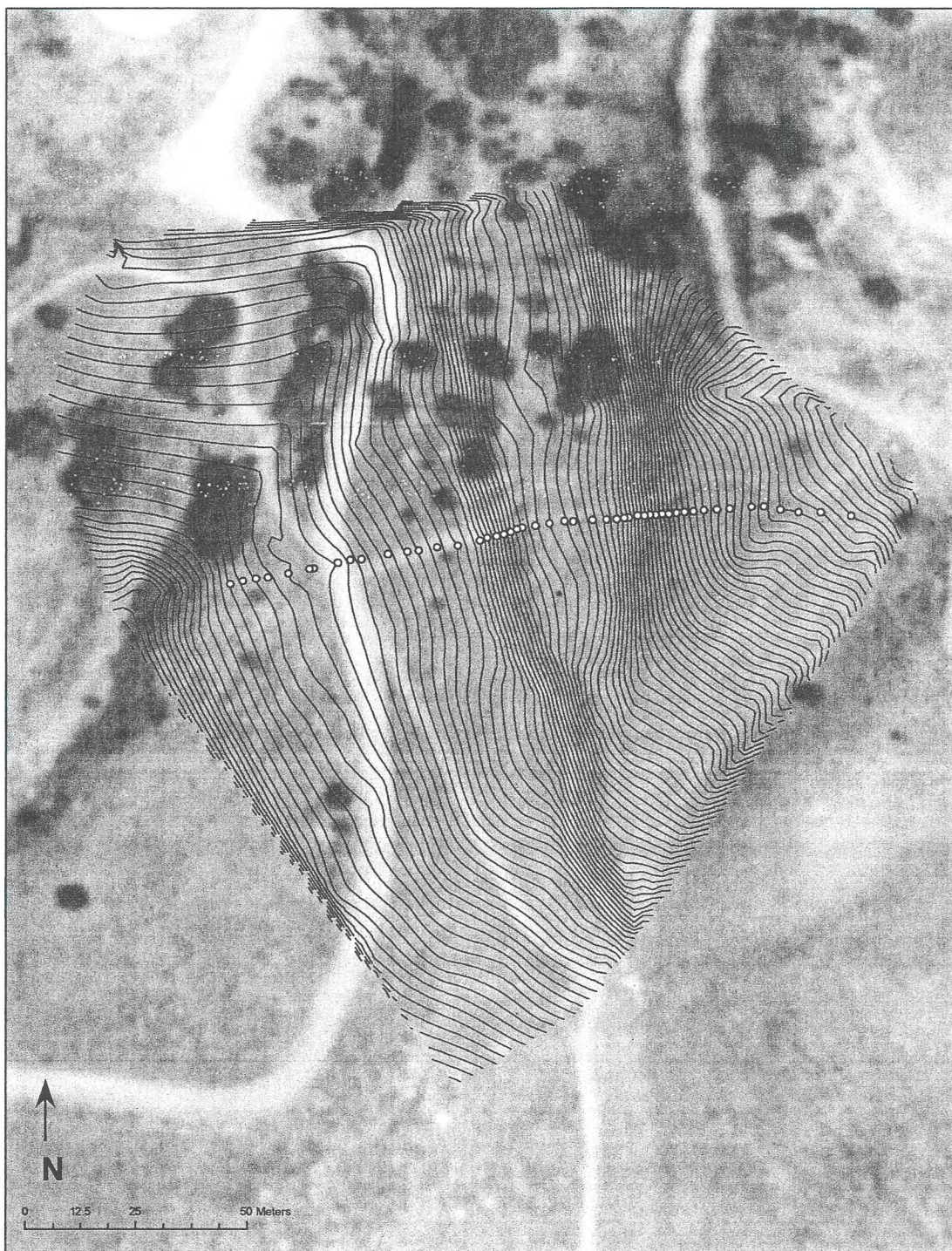
Figure 3. Topographic contour map of the Rice Creek trench site. Map generated from elevation data measured with survey-grade GPS. Contour interval: 0.5 m.